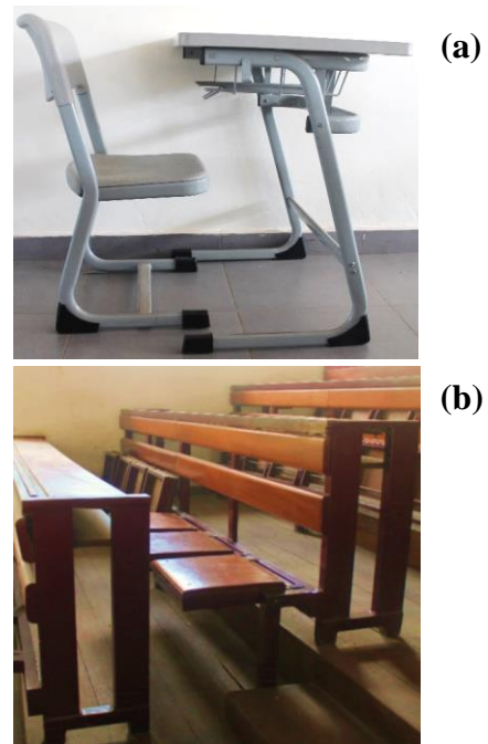
Figure 2. Side views of the (a) plastic (imported) and (b) wooden classroom furniture used by the students