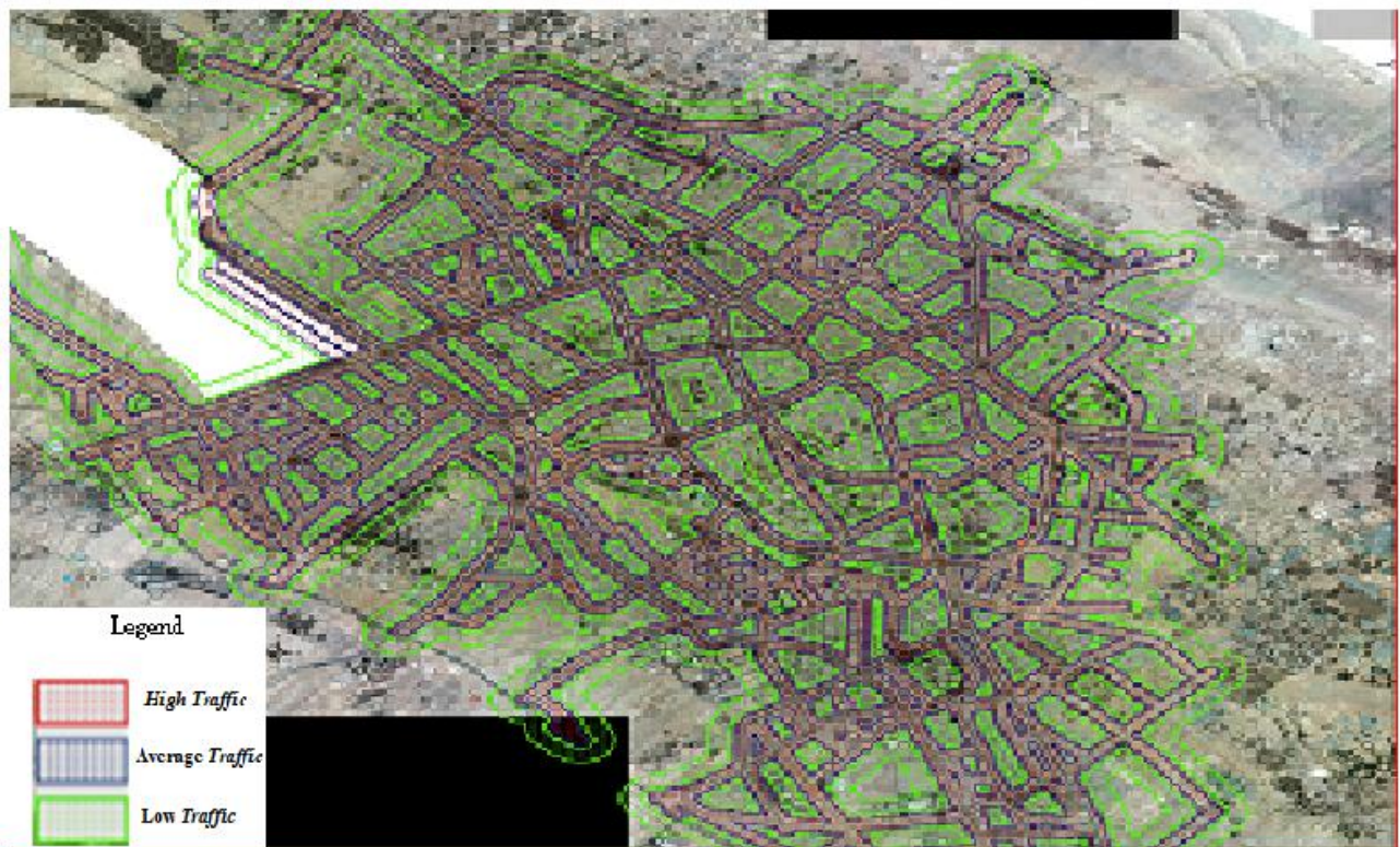
Figure. 1: Categorization of Yazd city into Three Areas with Low, Medium and High Traffic

To calculate the sample size, the minimum correlation coefficient ( r=0.35 ) between the sound sensitivity score and the aggression score, as well as the first ( \alpha=0.05 ) and second ( \beta=0.20 ) type errors were considered. 300 people were included in the study. Through stratified random sampling, authors included 100 people from each category (with low, medium and high traffic) in the study.