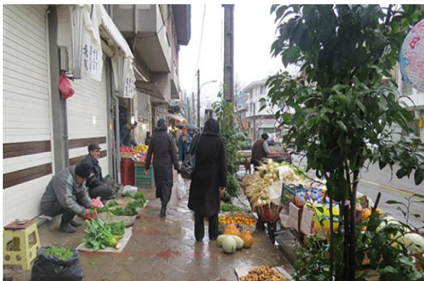
Friday Bazar in Rasht (In the north of Iran)