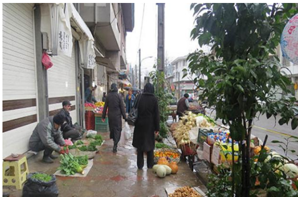
Friday Bazar in Rasht (In the north of Iran)