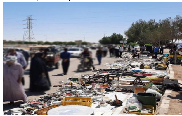
Friday Bazar in Ahvaz (In the south of Iran)