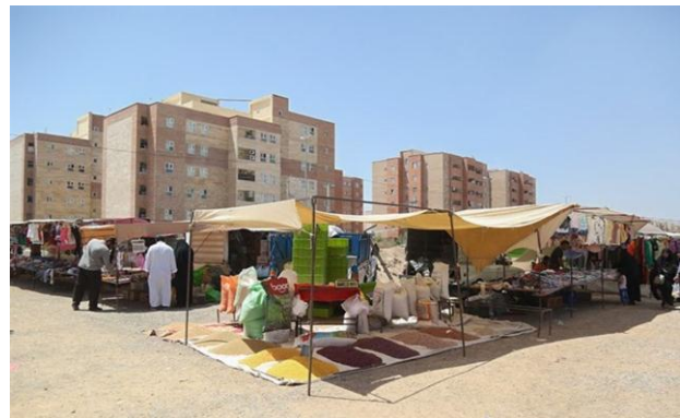
Tuesday Bazar in Qom (In the upper half of center of Iran)