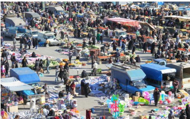
Wednesday Bazar in Gorgan (In the north of Iran)

Despite the stated advantages and the important role of these types of markets, unfortunately, the environmental, structural, and welfare conditions of these types of markets are usually not suitable for sellers and visitors. Since they are temporarily formed in different neighborhoods, suitable facilities for both sellers and visitors are not often provided.