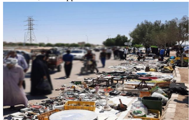
Friday Bazar in Ahvaz (In the south of Iran)