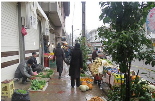
Friday Bazar in Rasht (In the north of Iran)